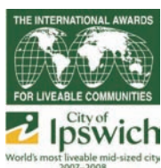
"City of Ipswich LivCom Logo" colour version

Throughout this document the term "City of Ipswich LivCom Logo" refers to the graphic below: